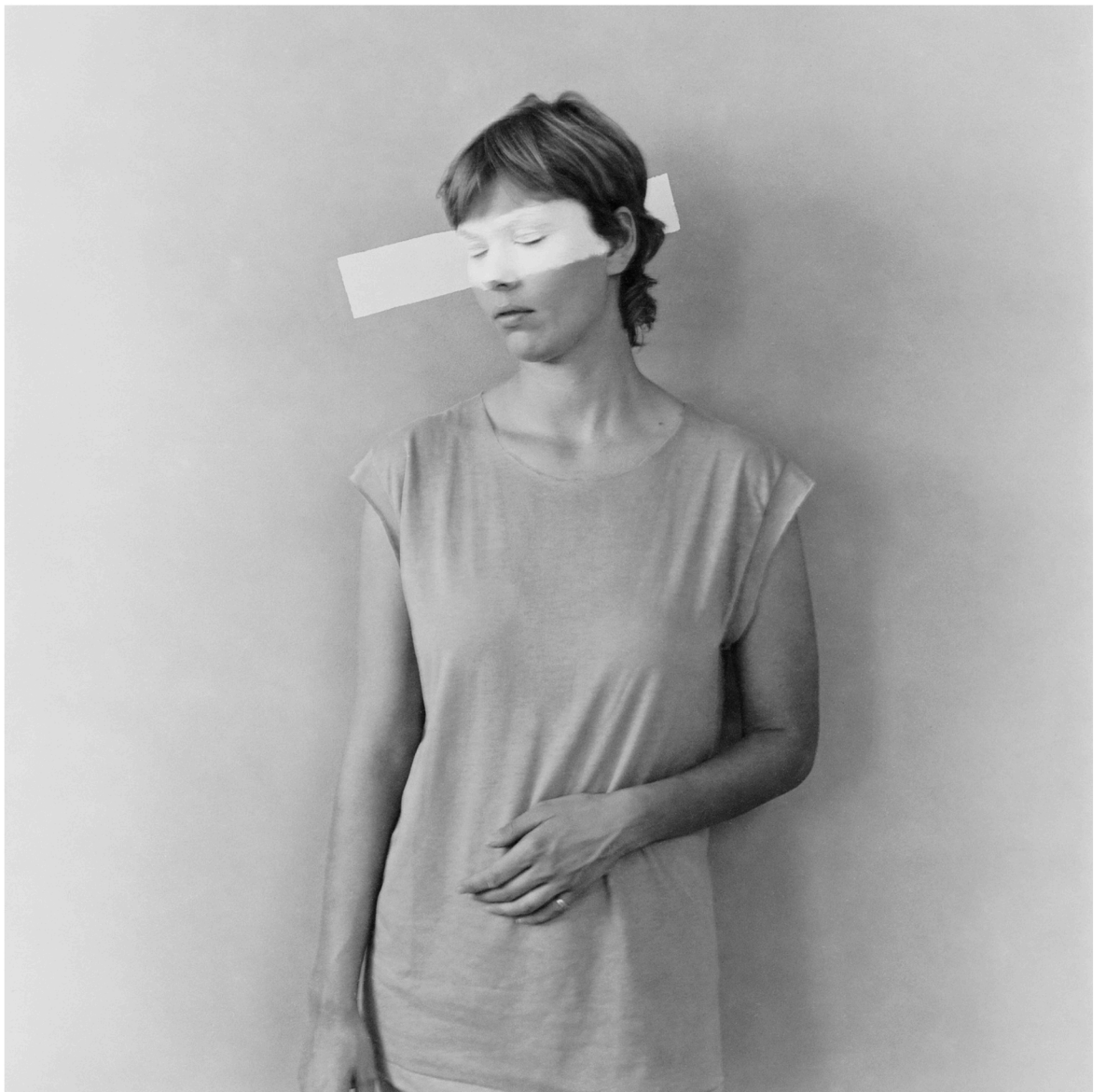
Uta Barth, painted self portrait, 1985