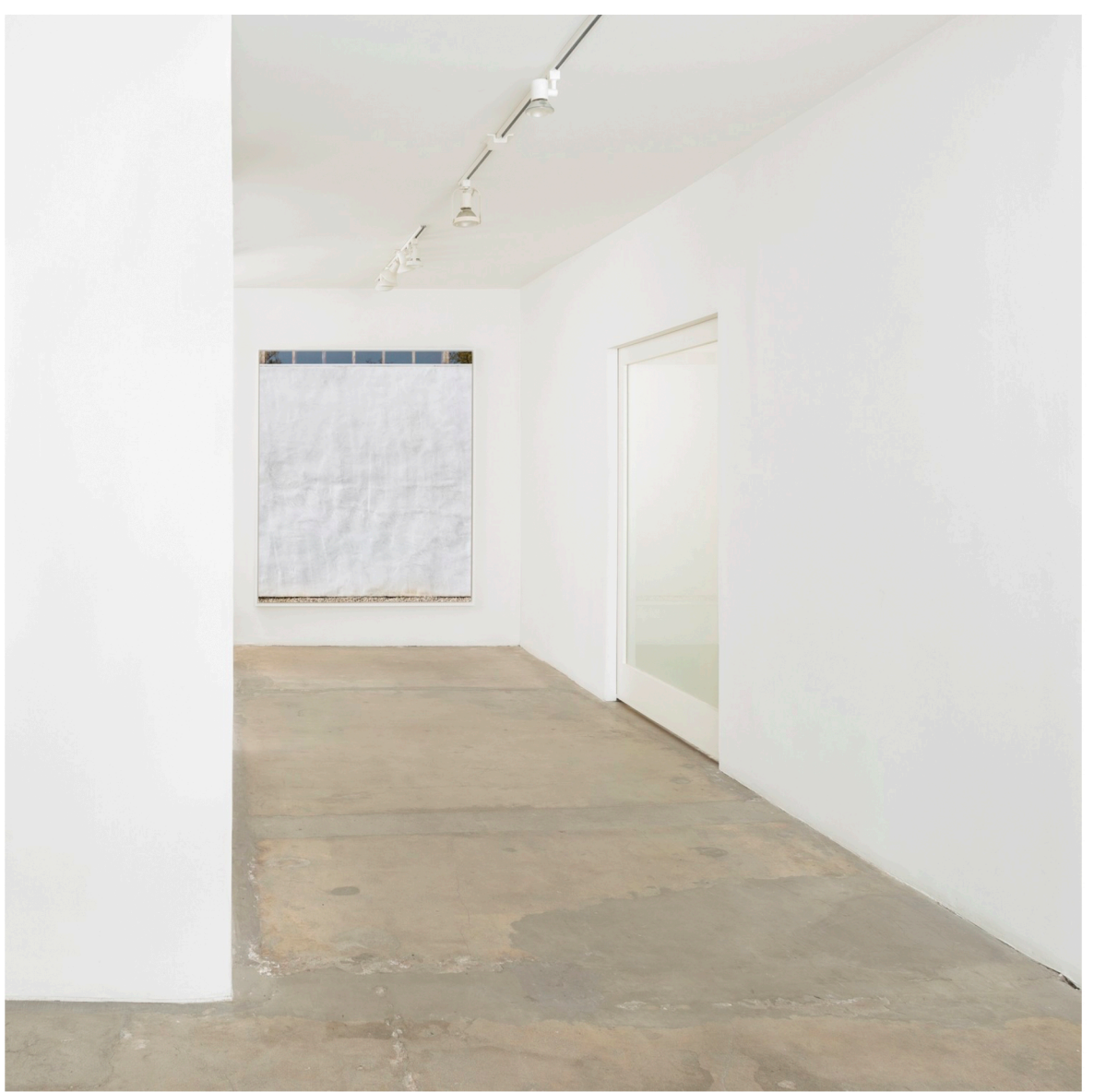
Uta Barth, installation view 1301PE

1301PE is very pleased to present — Uta Barth “Two Sides of the Coin”. For the past twenty-five years, Uta Barth has made visual perception the primary subject of her photographic work. Barth has said, “my primary objective has always been to find ways to make the viewer aware of their own activity of looking at something ... by straining your perception of things that are barely visible, in some instance depicting purely light itself” (In Between Places, Conkelton, p.23, 2000)