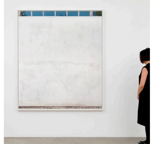
Uta Barth, Untitled (17.05) , 2017 Archival pigment print in artist frame 75 ¾ x 64 ⅞ inches