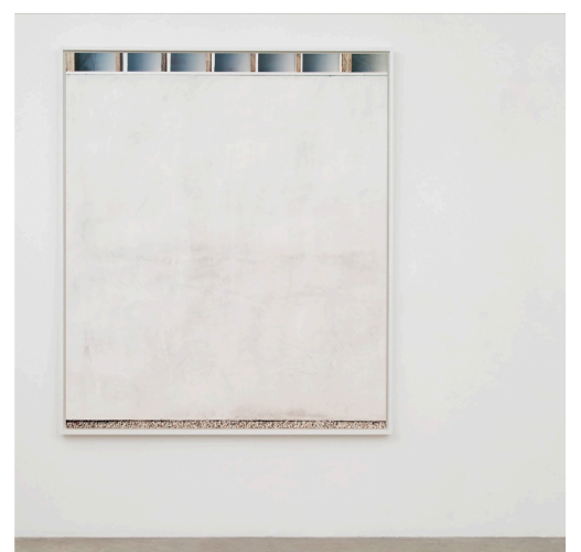
Uta Barth, Untitled (17.07) , 2017 Archival pigment print in artist frame 75 ¾ x 64 ⅞ inches