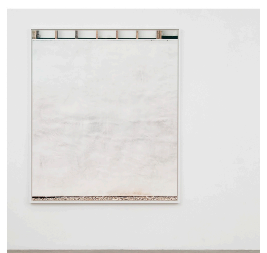
Uta Barth, Untitled (17.06) , 2017 Archival pigment print in artist frame 75 ¾ x 64 ⅞ inches