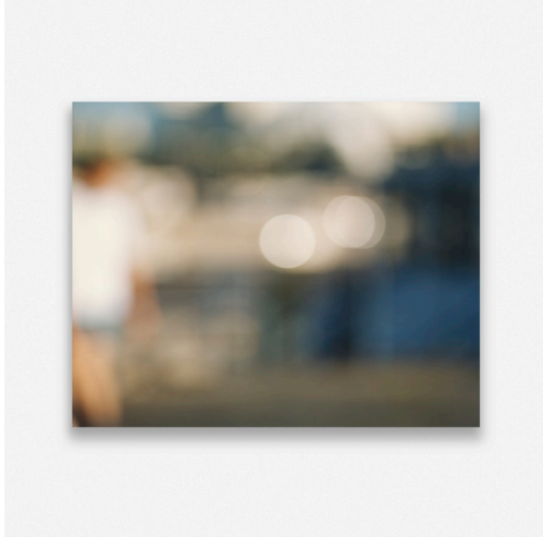
Uta Barth, Field #6 , 1995 Medium: Color photograph on panel 28 ¾ x 23 inches

Field and Untitled 2017 achieve this in different ways, as the subject expected in a traditional photograph is missing. One “empties” out the image by blurring a crowded world, the other uses hyper-sharp focus, while looking at an empty scene. Both projects are continuations of a career-long engagement with and exploration of visual perception.